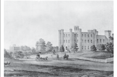
Painting of Old Wesleyan Hall